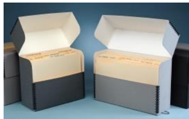
1 Acid Free Document Box