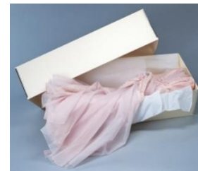
1 Costume Storage Box