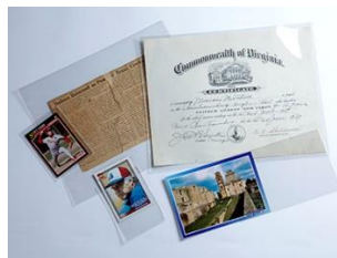
3 Mil Archival Polyester Envelopes