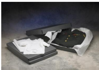
1 Keepsake Dress/Gown/Uniform Preservation Kit