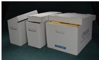
1 Acid Free Archival Bankers Box

As part of your gift we ask that you consider a donation to the museum to apply toward adequate storage of your object. Below are some recommended gift amounts based on the needs of the donation. Specific estimates can be obtained for you based on the objects you are donating.